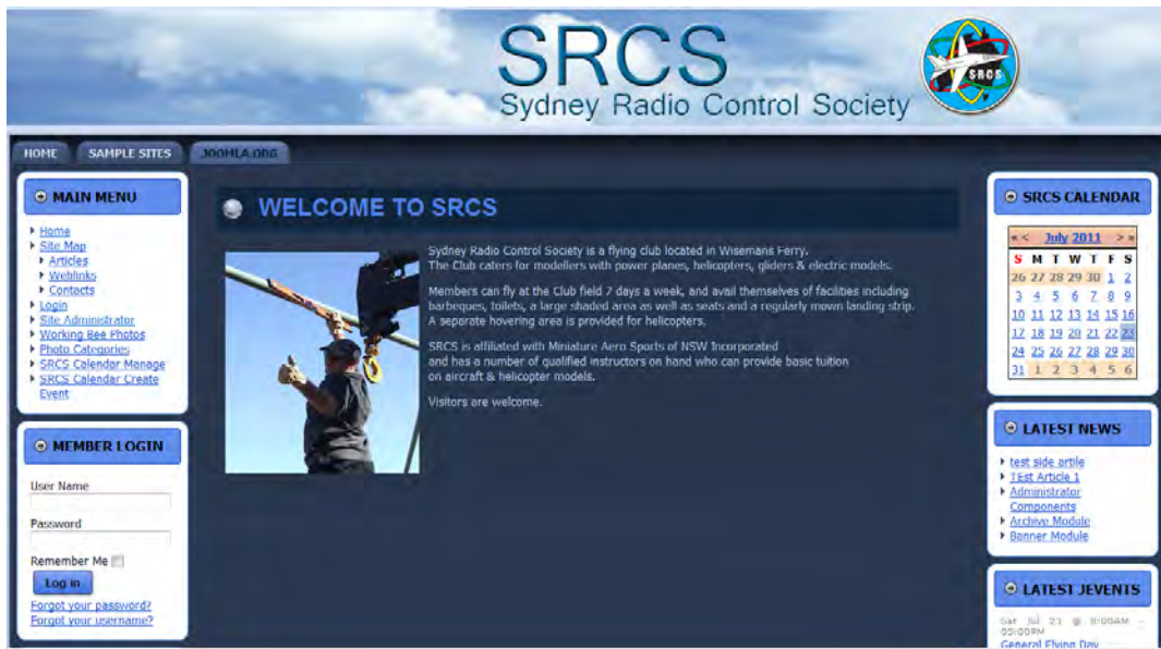
Sneak preview of what's coming!

Even as this newsletter goes to print we are currently working on a host of new features that will be appearing on the site soon. The most exciting of these is the calendar feature that will allow members to add events to the calendar letting all other members know when they will be at the field flying, hopefully this will encourage to make better use of our great field.